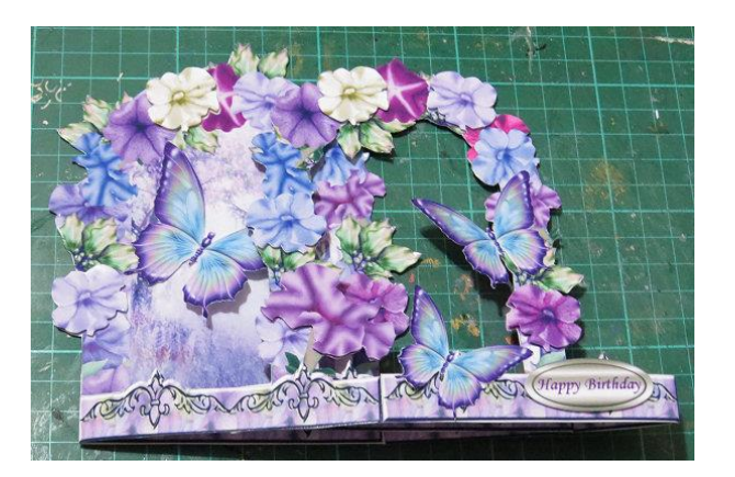
When flat your card will look like this and will fit into a C5 envelope. (Size is approx. 21cm x 15cm when flat).

11. Add your decoupage items wherever you wish.