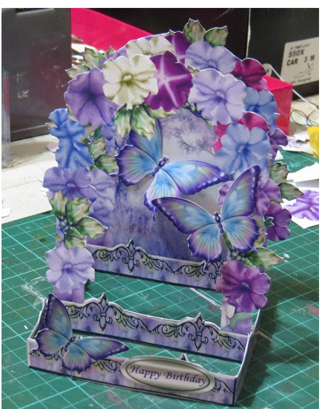
On the back there is space for your own message.

11. Add your decoupage items wherever you wish.