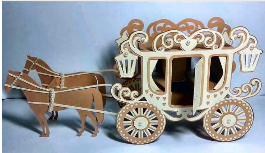
Princess Fairytale Carriage