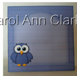
The back of your card

Add the head to the animation bar, sticking firmly in place.