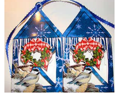
10. Folds Flat for mailing.